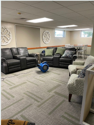
Limited Medical Clinic teen classroom