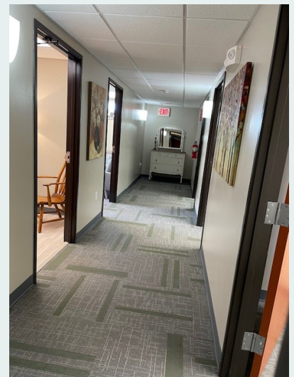
Limited Medical Clinic hall